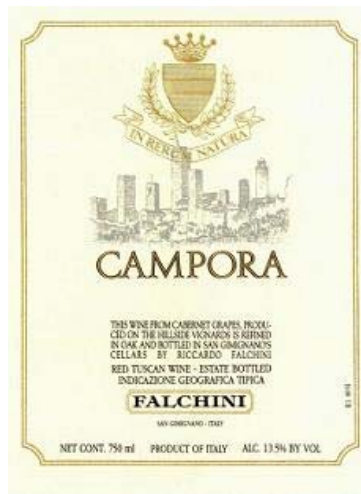
Riccardo Falchini Cabernet Sauvignon 'Campora' One of Tuscany's iconic cabs

Vin Santo del Chianti 'Podere Casale' DOC