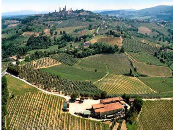
Casale Falchini and the towers of San Gimignano (Siena)