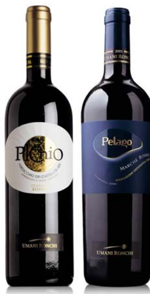
Plenio and Pelago: Umani Ronchi's most awarded wines

Umani Ronchi has received many important awards in both the domestic as well as the international arena: the single vineyard Verdicchio Riserva Plenio won the prestigious Tre Bicchieri from Gambero Rosso for five consecutive vintages (2001-02-03-04-05) while the first vintage of Pelago , a blend of Cabernet, Montepulciano and Merlot won the Best Red Wine award in 1997 at the London International Wine Challenge .