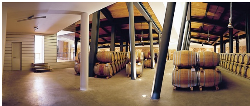
The high-tech bottai at Umani Ronchi

Designed by Italian architect Marco Vignoni, the futuristic cellar, built by excavating the hillside underneath a vineyard, houses over 600 wooden barriques and is equipped with ultra modern temperature and humidity control systems. It was reviewed in the Architectural Digest as an example of Italian design meeting industrial function in which the angled steel pillars and the sloping ceilings are designed to withstand the weight of the soil above.